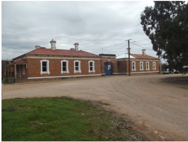
Two images of the Gladstone Gaol showing work progressing in the upgrade of the buildings