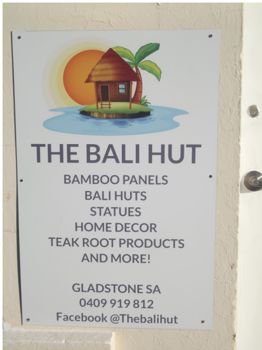
Part of Locky's is The Bali Hut